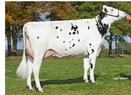
Sound System Chenille